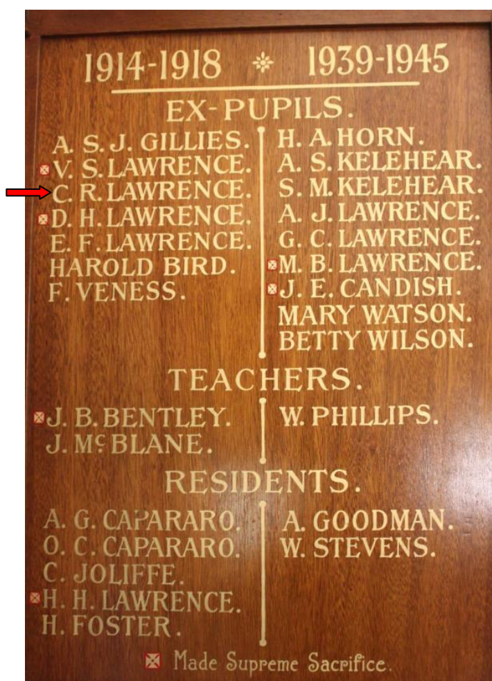
Lostock Public School Honour Board