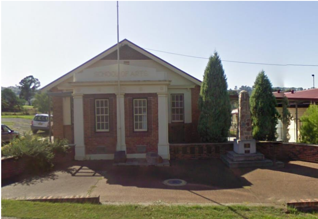
Gresford School of Arts War Memorial